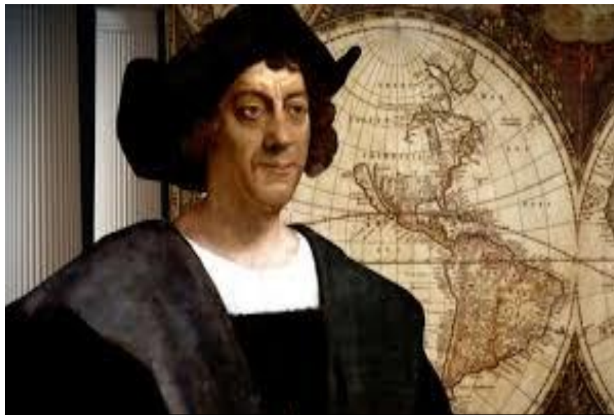
Christopher Columbus (sailor)