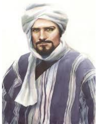
Ibn Battuta (explorer)

Famous for - Journeying to the Middle East, North Africa, India and China over 700 years ago. He travelled over 72,000 miles before planes were invented!