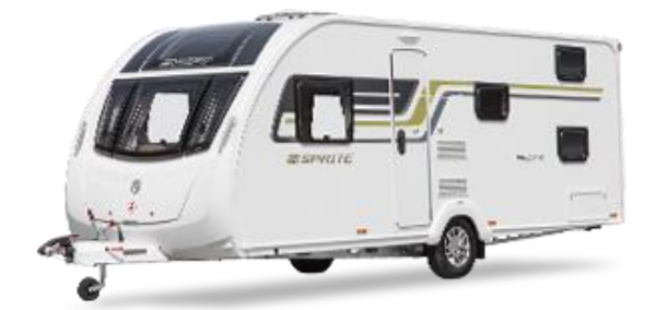
Caravan These houses are special because they can be moved by car to a new place.

Semi-detached Houses These are two houses that are side by side.