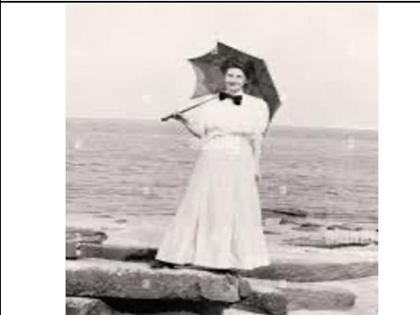
parasols - These are umbrellas which are used to shade you from the sun.