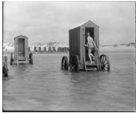
bathing huts - These were huts that people could get changed in.