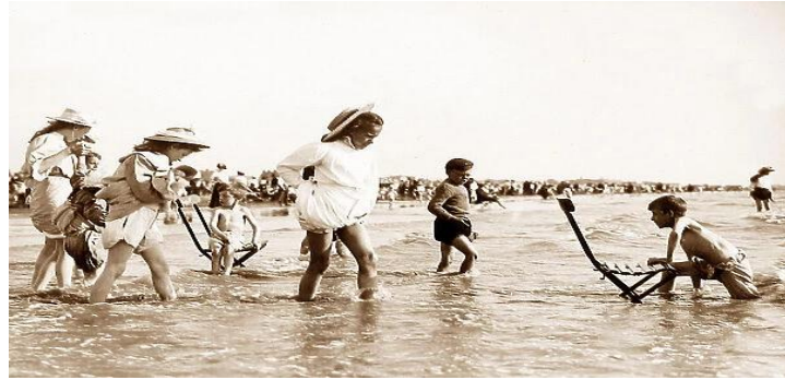
playing in the sand and sea