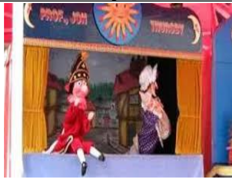
puppet shows - The most famous of these is the Punch and Judy show.