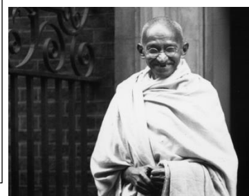
A photo of Gandhi outside of 10 Downing Street

Gandhi was famous for wearing a white dhoti (loincloth) and shawl.