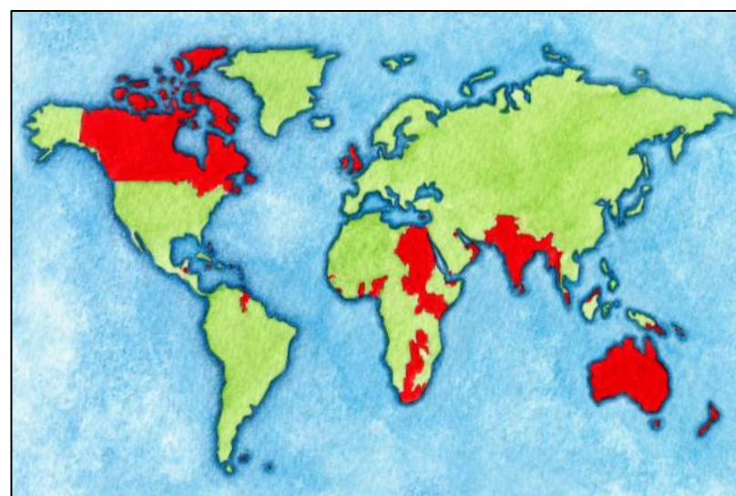
A map of the world showing countries which were part of the British Empire

In 1947, India was granted independence. Unfortunately, on 30 th January 1948 (in New Delhi) Gandhi was assassinated by an Indian who felt that Gandhi favoured British India's Muslims more than Hindus.